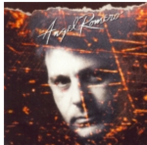
“Remembering the Future” Angel Romero, guitar RCA Victor CD-09026-68268-2