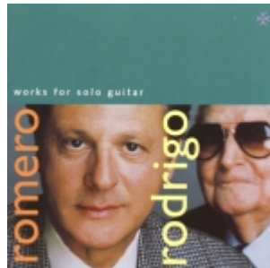
“Romero/Rodrigo – solo works for guitar” Angel Romero, guitar